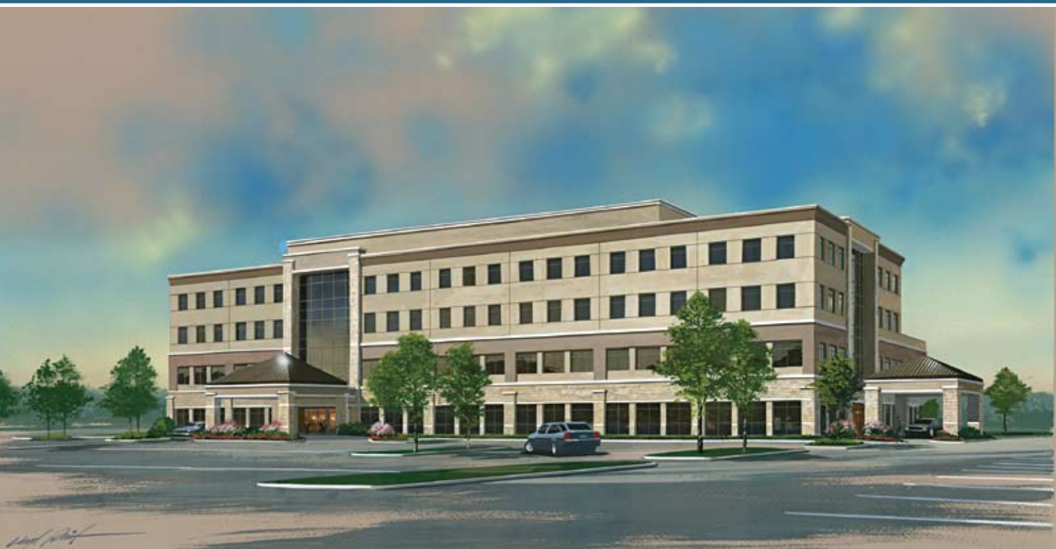
Seton Williamson Medical Plaza I Round Rock, Texas